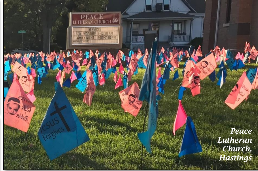
Peace Lutheran Church, Hastings