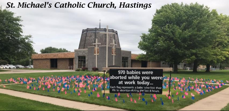
St. Michael's Catholic Church, Hastings