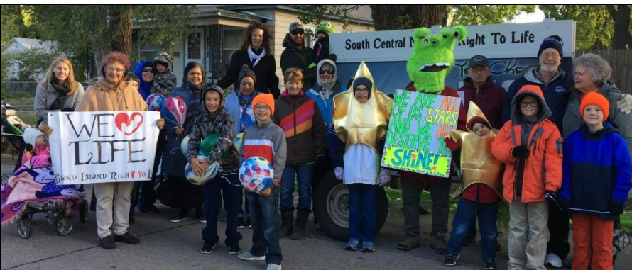
Above: Our float at the Harvest of Harmony Parade - October 6, 2018. Our SCNRTL group walked with the Grand Island Right to Life group. Thanks to all who walked!