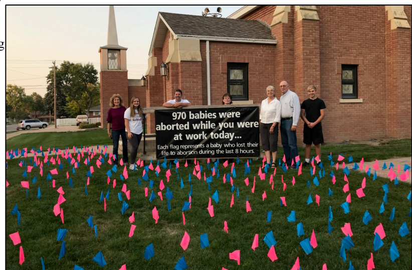
The Pink & Blue Baby Flag display was displayed recently at St. Michael’s Catholic Church (left) & Peace Lutheran Church (above) in Hastings. Thank you to those who helped install our display!