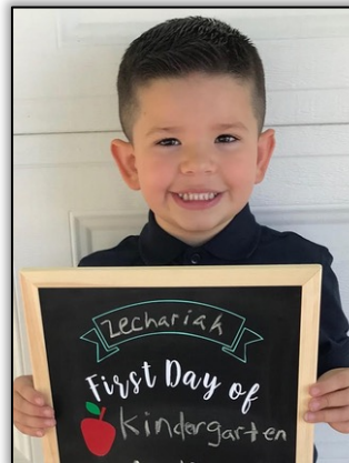
Teen Mom Saves Nearly-Aborted Son With Pill Reversal; He Is Now a Thriving 7-Year-Old

"While they may be able to prevent us from advertising at the moment, they cannot stop our friends from sharing the stories of hope that our Abortion Pill Rescue Network provides," she said.